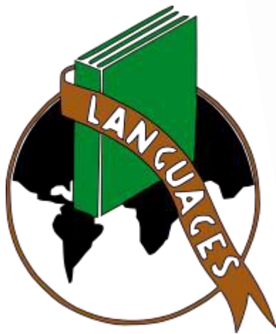
Language classes attended by the students

The pie graph shows which language classes students attended. Study the graph and answer the questions below.